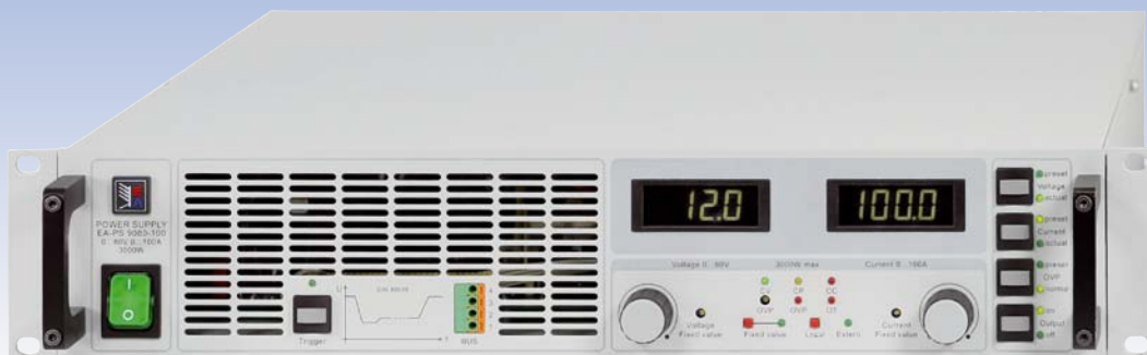
EA-PS 9080-100 ZH