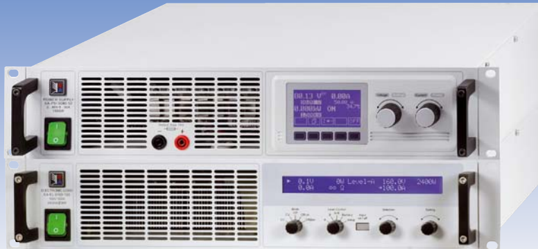
EA-PSI 9080-100 與 EA-EL 9080-200組合產品