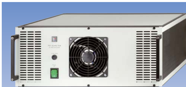
FET-開關 / FET Switch